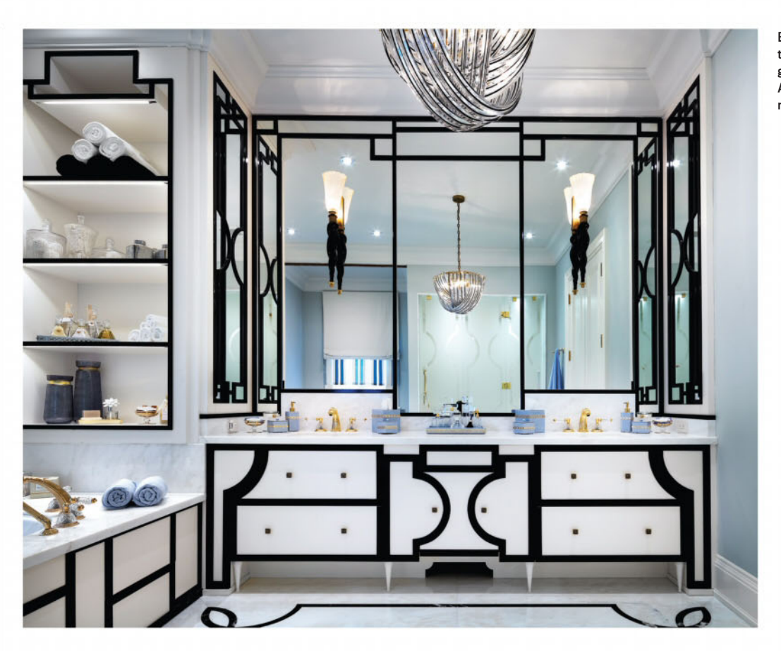
Black framework around the mirror and strong geometric lines bring Art Deco motifs into the master bath.